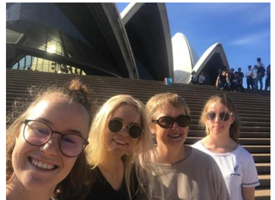
We went to Sydney and had lunch at the Sydney Tower Eye. The last day in Sydney was spent at Manly Beach.