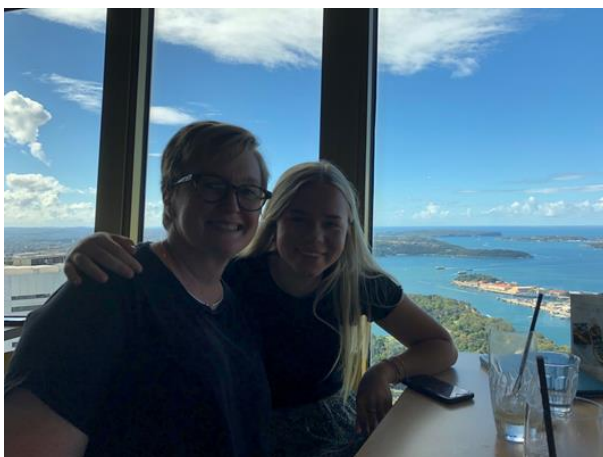
I had an amazing time trip.