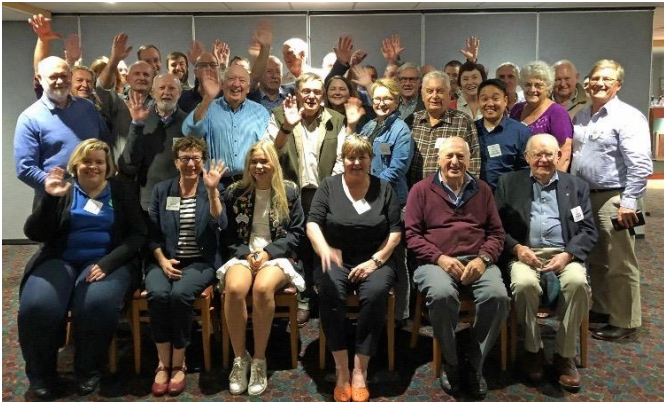
Members and guests gathered after the meeting for a photo.